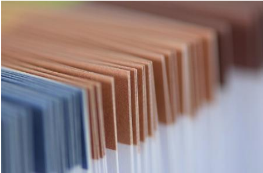
Plans & Reports