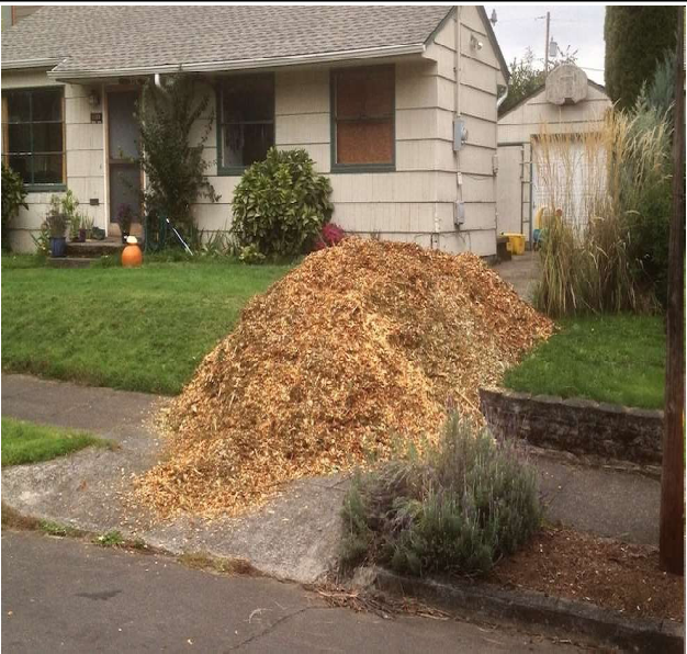
This homeowner has the right idea by placing his stockpile off the street, but he's blocking the sidewalk (a code violation) and needs sheeting protection at the base of his pile.

Getting ready for some fall plantings or wanting to tackle a landscaping project in cooler weather? If so, please remember a few basics to ensure you are not in violation of the Troutdale Municipal Code and are protecting water quality in Beaver Creek and the Sandy River too. Ideally, bark dust, soil, rock, gravel and other such material should be deposited and stockpiled on private property in the driveway or yard. If that's not feasible, homeowners can apply for a Public Works right-of-way permit to have a stockpile in the street. However, these should never be placed next to a curb inlet. Such materials could clog the drain and cause flooding, and the inlets drain to the storm sewer system.