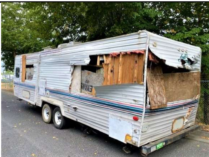
The City will pay approximately $4,000 to dispose of this abandoned trailer, much of that covering hazardous waste disposal, towing and storage.

I would encourage anyone with chickens to call me and apply for our chicken permit, which at this time we are not charging for because it isn't set up quite yet. But if you apply, I'll bring you information and suggestions that will help limit the rodent invasion. I can also provide traps or bait stations if it looks like the rodents have established themselves. I will only ask that you provide the bait of your choice which can be picked up at any home or farm and feed store. The traps and bait stations are provided by the City.