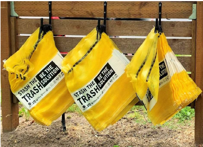
You’ll find your Stash the Trash bag at the trailhead on your way down to the beach.

We have just the solution! Simply pick up a ‘Stash the Trash’ yellow mesh bag at the park kiosk located at the top of the trail that descends to the beachfront. You’ll find it next to the