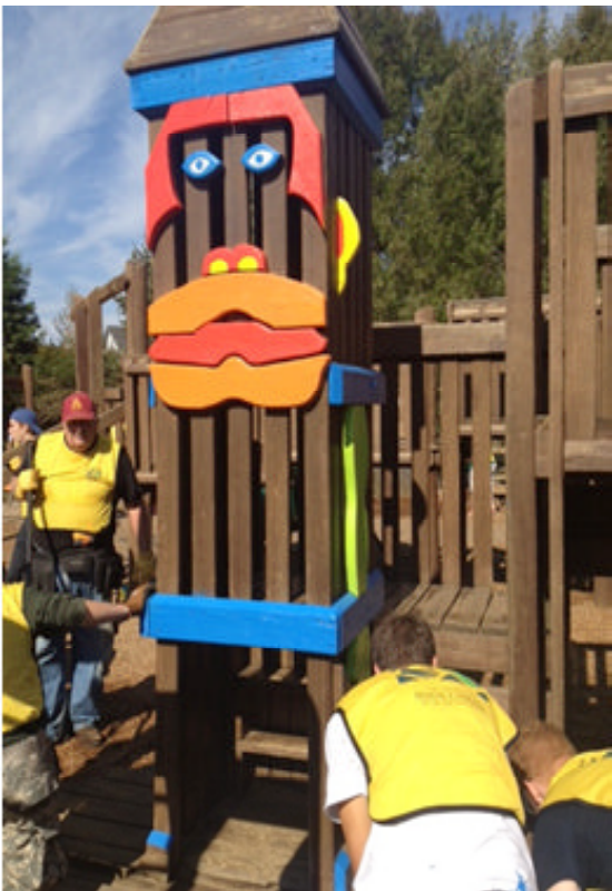
Volunteers put the finishing touches on a portion of Imagination Station during 'The City of Troutdale Volunteer Day' on September 15, 2012. Volunteers included church and school district members, City Parks staff, and many residents of Troutdale.

So mark your calendars for this amazing community event. Look for more detailed information in the next issue of the Champion.