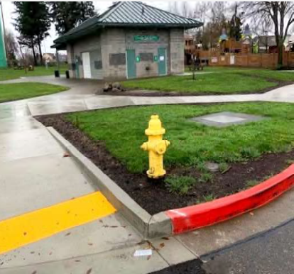
Improved ADA curb ramp and van accessible parking