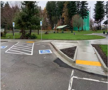
Reoriented ADA curb ramp and ADA compliant walk path

Reoriented ADA curb ramp, bike parking pad, van accessible parking, and ADA compliant walk path