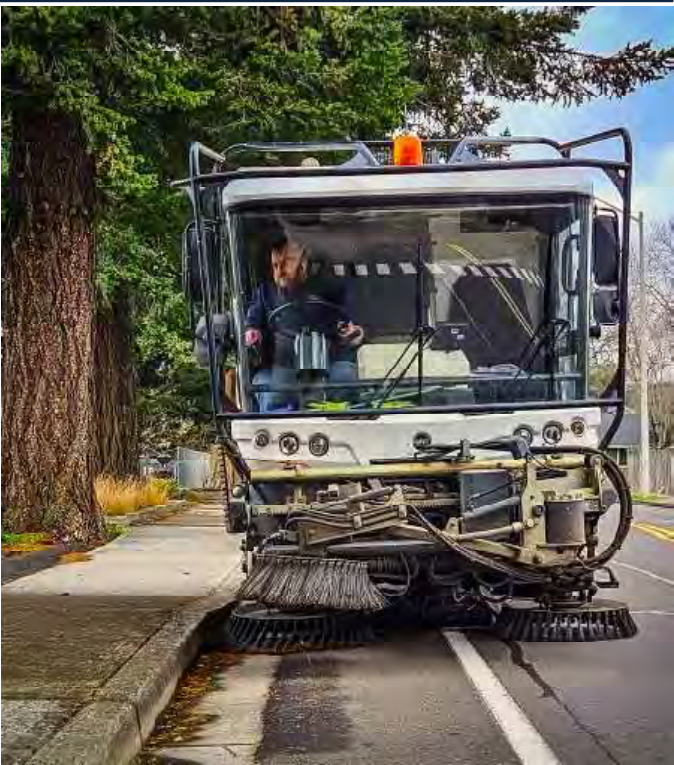
That's Streets Operator Cole Mankey in the driver's seat.

will only occur as a special response situation. The new zones have been updated on the City's website along with the street sweeping schedule for 2024. While our goal is to stay on schedule, please understand that weather challenges and equipment failures do happen and can result in delays or needed adjustments throughout the year. Troutdale residents can help street sweeping efforts by avoiding street parking on days our sweeper will be in your zone, trimming your trees to have an 11' clearance above the curb, and finally, please refrain from blowing fallen leaves into the street.