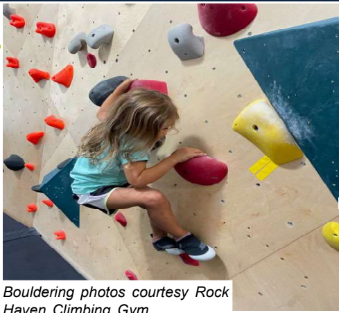
Bouldering photos courtesy Rock Haven Climbing Gym

We also have some fantastic on-going programs including Little Trout Play Park on the second Tuesday of every month through March, a variety of great offerings for all ages through the Troutdale Library , and a Fire-arm Safety/Concealed Carry Permit Class .