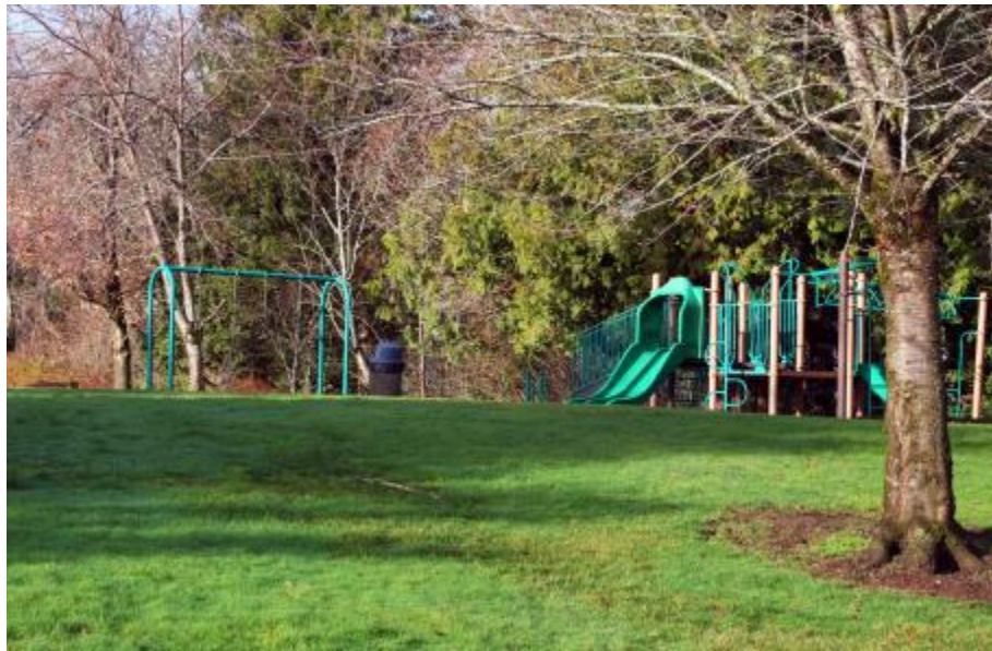
Helen Althaus Park