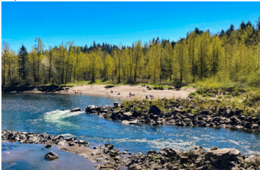
Glenn Otto Community Park