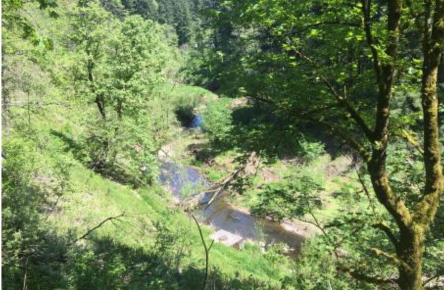
Beaver Creek Greenway