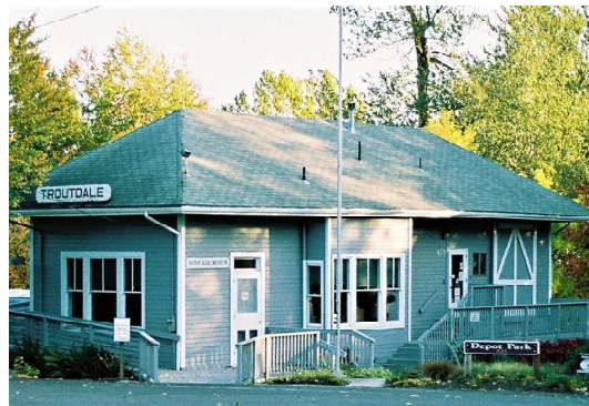
Above: The Rail Depot, 2015. The Rail Depot was originally located on the north side of the railroad tracks and was moved, in 1976, to what would become its permanent location in Depot Park, shown at right.

The City of Troutdale will soon welcome guests into the new Visitor Center in the historic Rail Depot. It is currently under renovation, with the original Station Masters office and waiting room remaining a museum, while the freight loading area becomes the visitor welcoming area. The space will be modernized, but in a way that pays respect to the historic nature of the building and the town. An exciting feature will be the restoration and placement in the entryway of the historic Multnomah Falls painting from old City Hall. Renovation of the 114 year-old Depot has also revealed historic details, which can be viewed during the open house on July 2. To follow along on the progress, follow @ExploreTroutdale on social media.