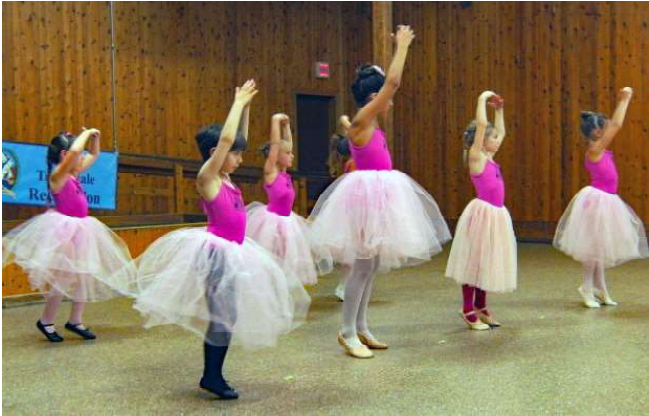
Above, Kindercombo, a combination ballet, tap and modern dance program, for ages 5-9 years. Sign up now on our new online registration system!

The new system, which is on a platform provided by CommunityPass , will require that everyone take a few minutes to set up a new account. But it is definitely worth the effort! The new site provides a much better online experience and offers some big advantages over our previous system. Just head over to troutdaleoregon.gov/rec for details and information on how to sign up.