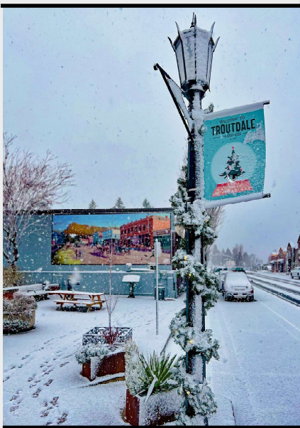
First snow of the season at Mayors Square