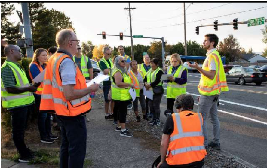
Multnomah County project leaders give tours to the Troutdale community, elected leaders and government staff for the SW 257th Drive Safety Improvements Project

People interested in receiving project updates or being notified when the survey opens can sign up by going to: http://MultCo.us/257th .