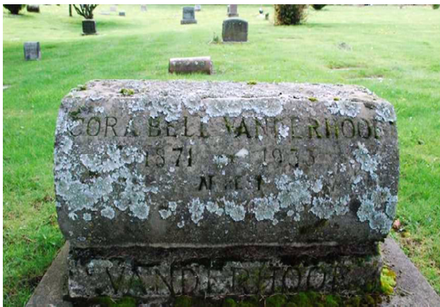
Douglass Cemetery, Troutdale.

For questions and reservations, call the Troutdale Historical Society office at 503-661-2164.