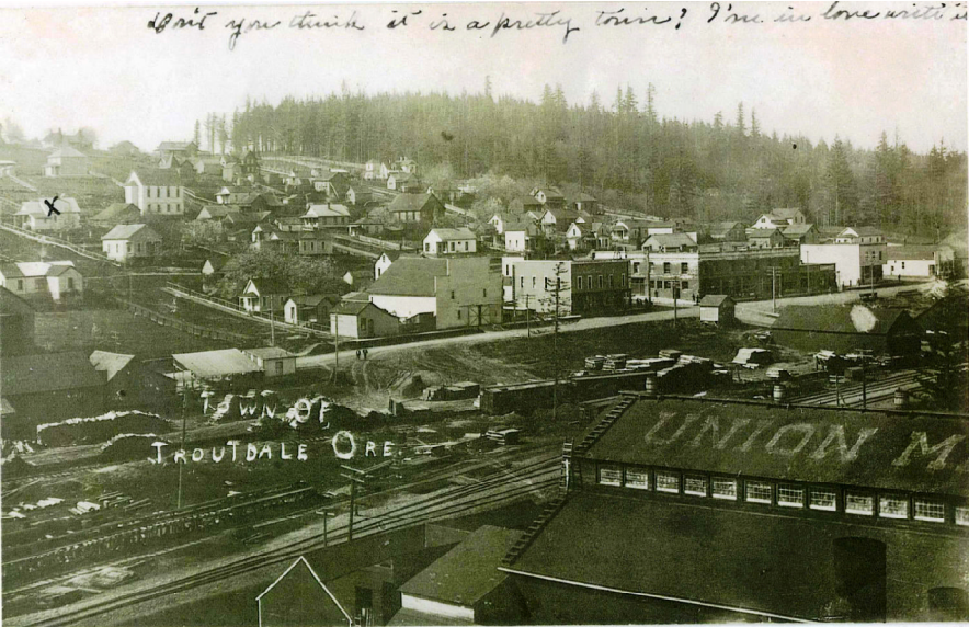
"Don't you think it is a pretty town?" Photo of Hungry Hill taken between 1907 and 1925, courtesy of Troutdale Historical Society.

Pick up nomination forms at the West Columbia Gorge Chamber of Commerce office, or find them online at www.westcolumbiagorgechamber.com/troutdale-summerfest . The deadline for submitting nominations is May 31st. For more information, call the Chamber at 503-669-7473, or email info@westcolumbiagorgechamber.com .