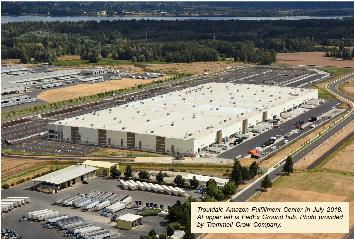
Troutdale Amazon Fulfillment Center in July 2018. At upper left is FedEx Ground hub.

The new commercial buildings will have ground floor retail/dining space with upper floor office space.