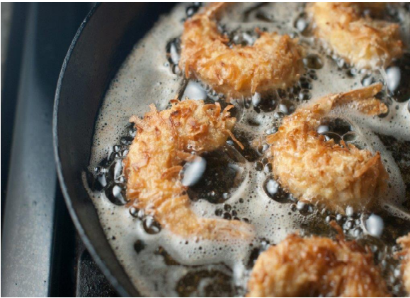
Don't let this ...

The leading cause of sanitary sewer overflows is mainly from residential customers pouring substances down their drains, and food service establishments with inadequate grease controls. Fats, oils and grease (FOG) are a byproduct of cooking and are mostly found in the following: meats, cooking oil, lard, shortening, butter and margarine.