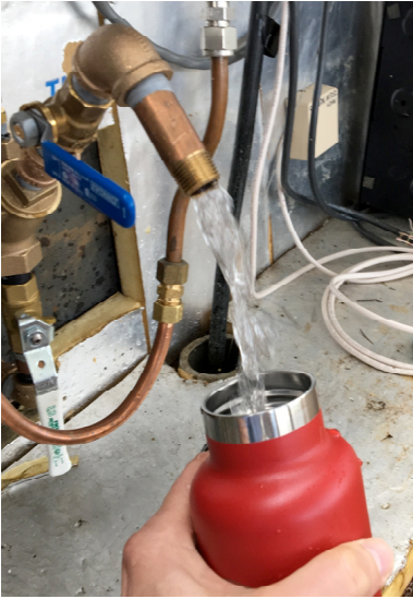
A Troutdale Public Works employee tests the water quality at Reservoir 4.

In late 2018, the interior of Reservoir No. 4 (Strebin Road Reservoir) was recoated with a primer and epoxy coating. In general, the reservoir serves areas east of Troutdale Road from Strebin Road and north to Cherry Park Road. In mid-May the reservoir was refilled and sampled for several different contaminants, of which all met or exceeded state and federal standards and the reservoir was placed back in service. Changes in water quality or pressure were expected, but if you have, or are continuing to have, water issues in the area of Reservoir No. 4, please call the Water Department at 503-674-3300.