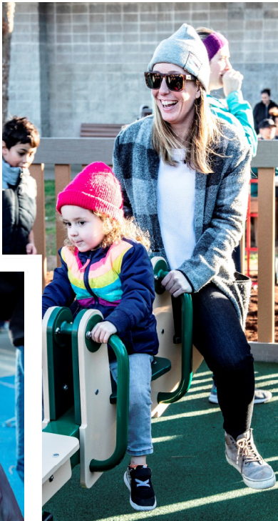
Upper left: Weedin Park, located at 1323 SE Beaver Creek Lane, has play equipment, tennis and basketball courts, a picnic table, and large grassy areas.