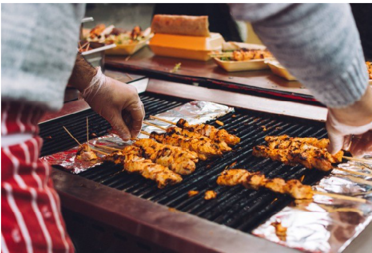
Zarephath Kitchen and Pantry provided food for over 200,000 meals in 2018, helping low-income families, the elderly and the homeless in Gresham, Troutdale, Wood Village, Fairview and surrounding areas.

Come support this family-friendly event! Enjoy great food and drink, be entertained by five local bands, see a great mixture of business and community groups, and art and craft vendors - and lots more, all while supporting a worthwhile and necessary cause. All proceeds will go to benefit Zarephath Kitchen and Pantry.